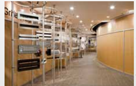
Casa Grande, AZ