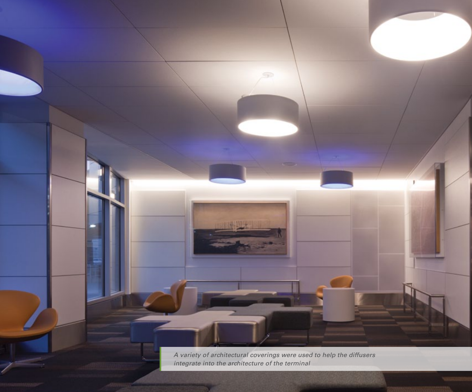
A variety of architectural coverings were used to help the diffusers integrate into the architecture of the terminal

testing facilities at Price Research Center North. Smoke test videos demonstrated to the entire design team that the performance of the displacement diffusers is in no way hindered by the enhancements. Satisfied that the custom diffusers would perform as expected and integrate well into the design of the terminal, the team approved them for installation.