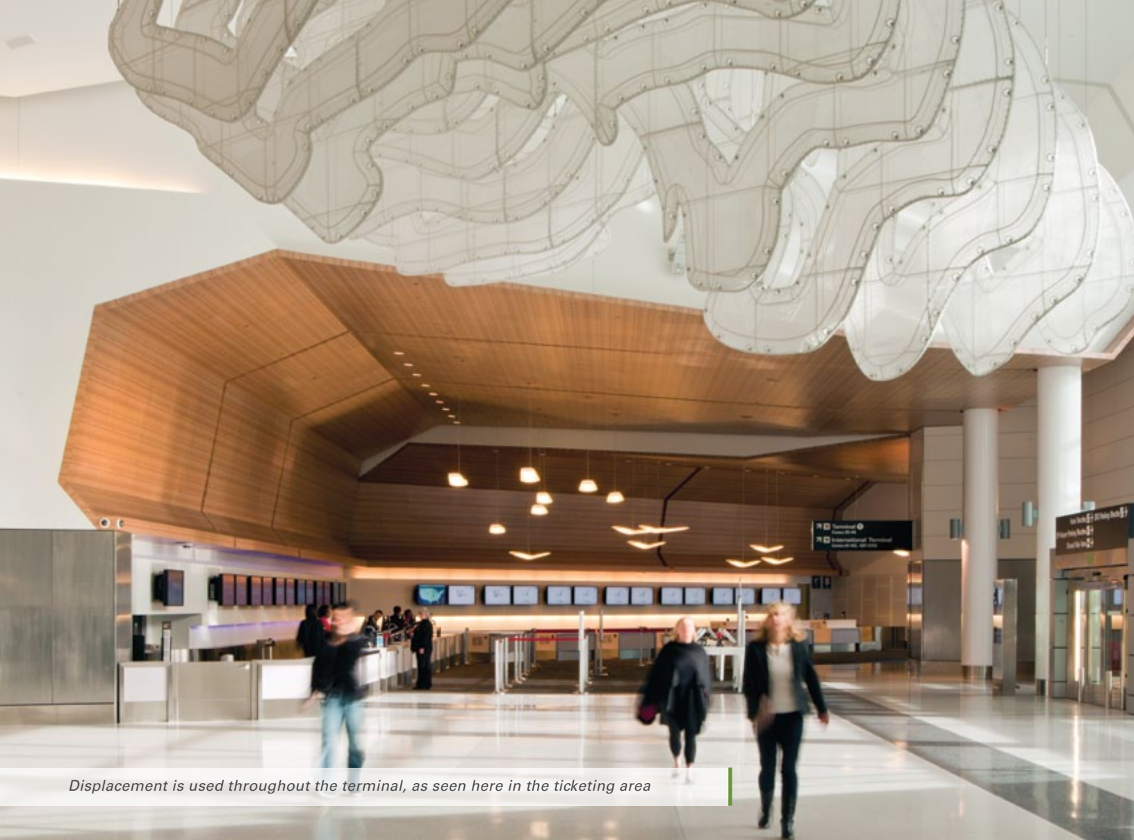
Displacement is used throughout the terminal, as seen here in the ticketing area