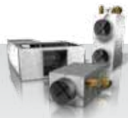
Terminals & Controls