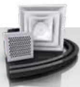
Grilles & Diffusers