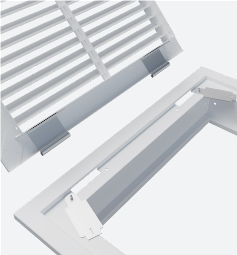
Toolless removable face to simplify access to duct and filter removal