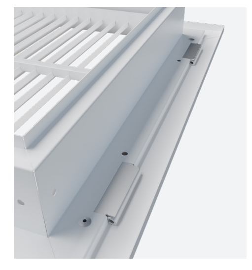
Zero-clearance hinge that eliminates the need for notching installation surface