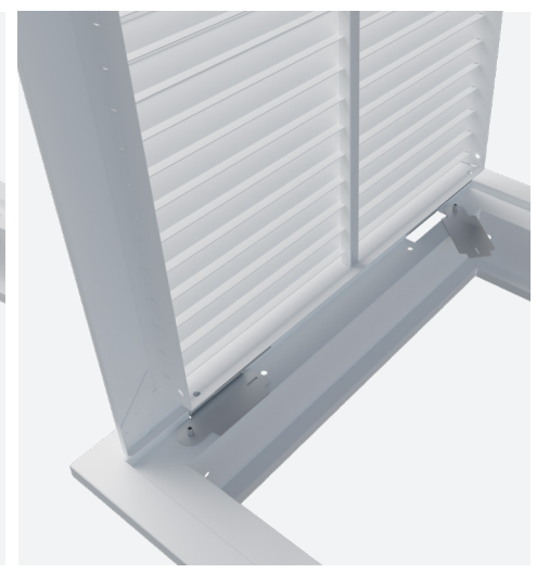
Toolless hinge locking mechanism to ensure face remains locked in place