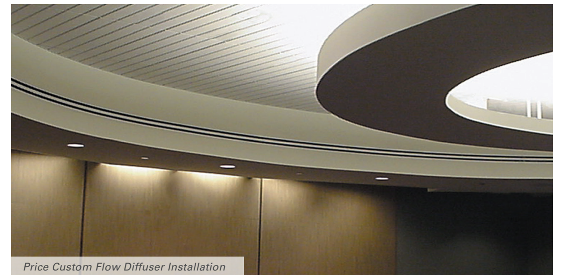
Price Custom Flow Diffuser Installation