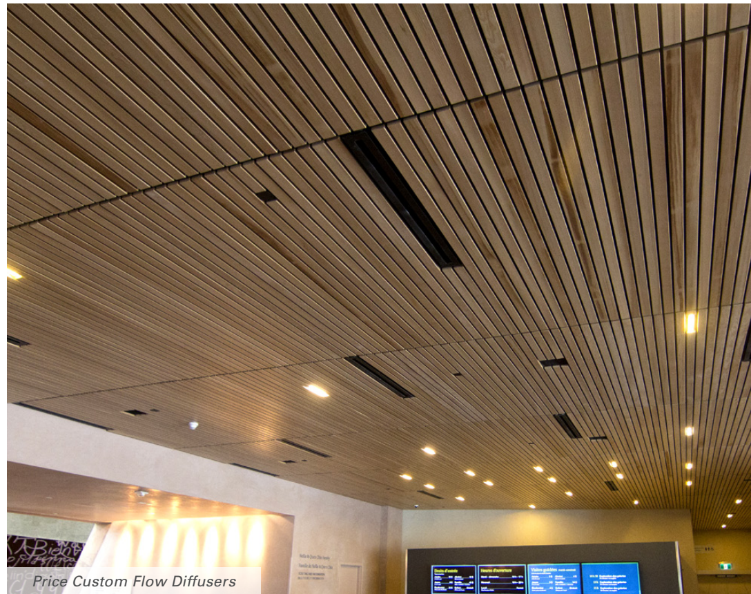
Price Custom Flow Diffusers